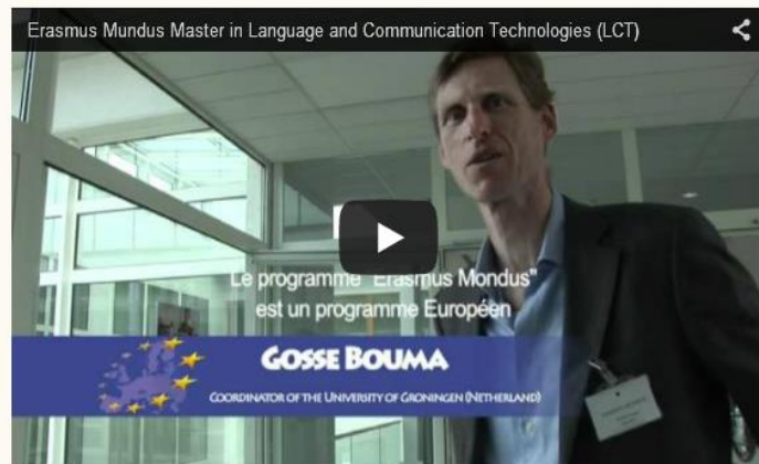
EMLCT Program Promo (Preliminary Cut)